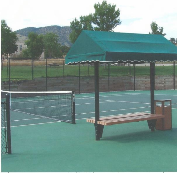
Attachment 1 – Kiosk at Courts 13 and 14 (2016).